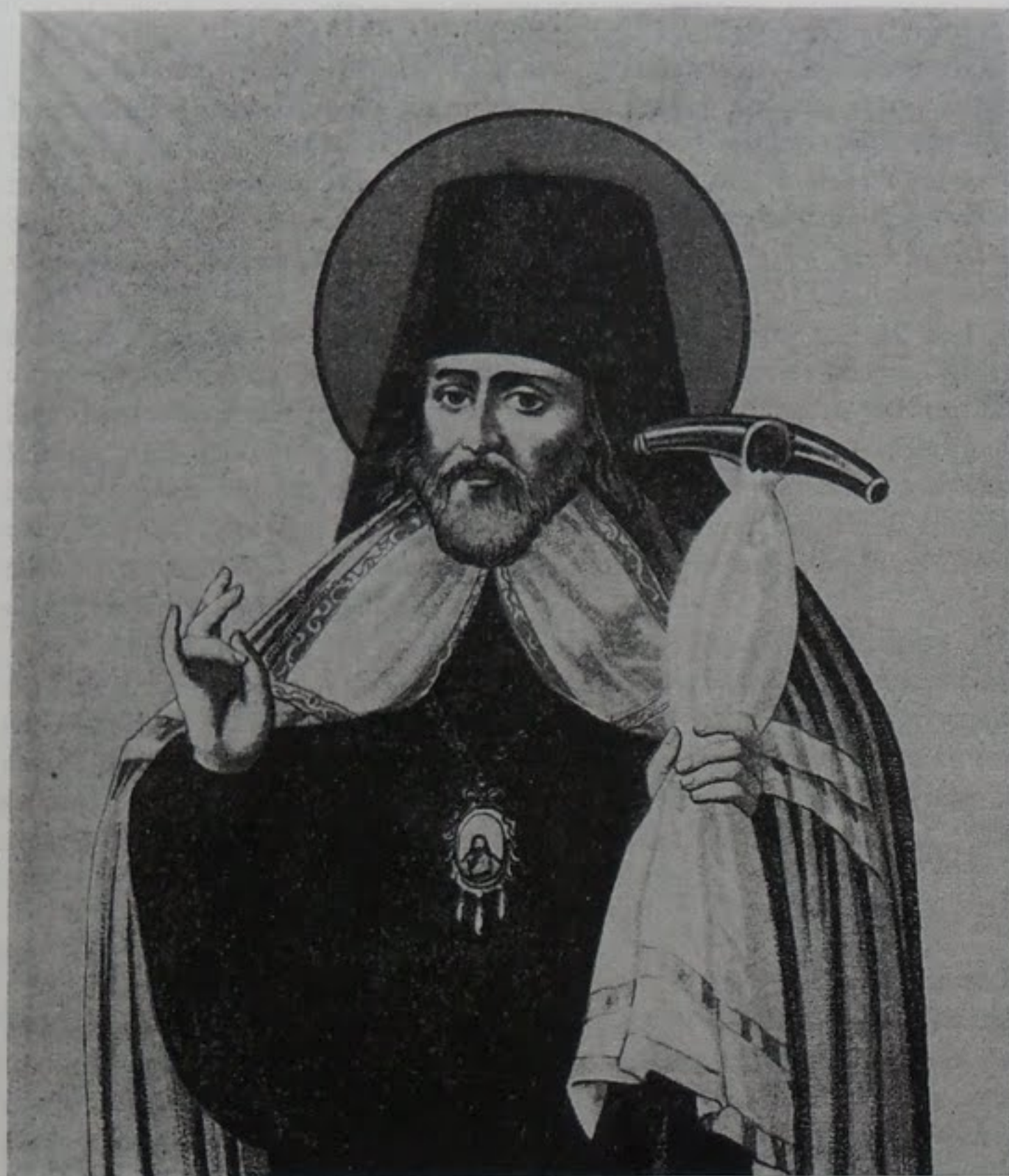
ST. INNOCENT OF IRKUTSK